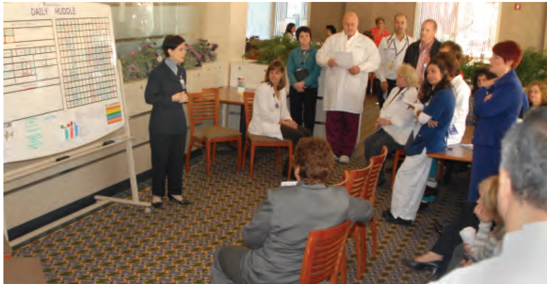
Bitsoli leads a daily huddle.

Reward and recognition was another important piece of the process. Employees who are mentioned positively on a survey are entered into a monthly drawing for a $50 gift certificate. They also get a “You’re a Star” card for a free lunch in the cafeteria. “We’ve found that praise is very important and very rewarding to the department.”